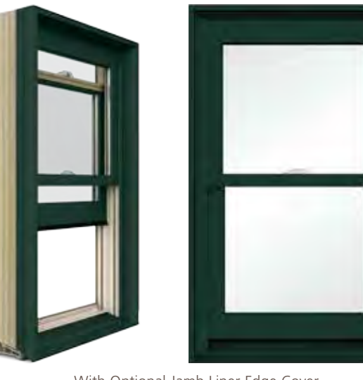
With Optional Jamb Liner Edge Cover