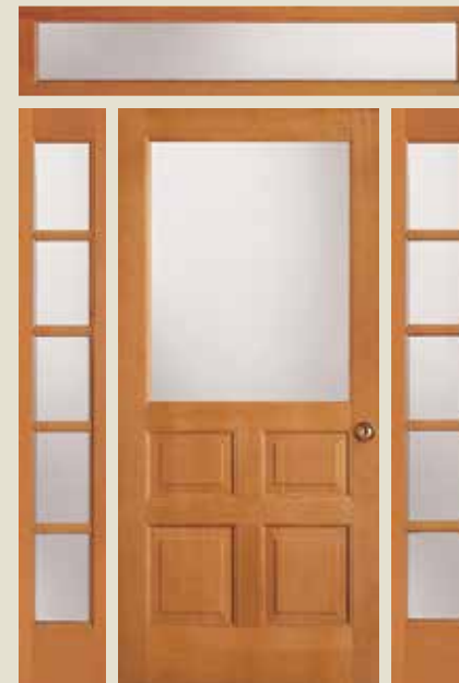
7571 IG with 37705 SDL, IG/7705 TDL sidelights, 7751 transom