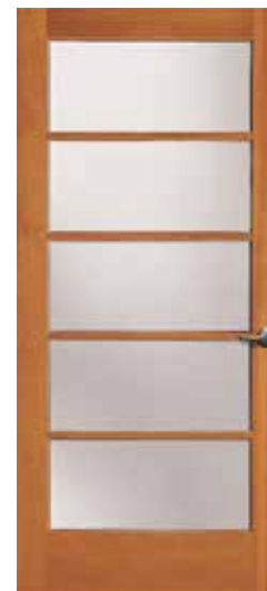
37105 SDL, IG 7105 TDL