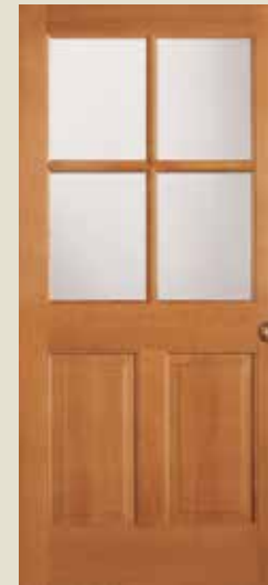
37444 SDL, IG 7444 TDL