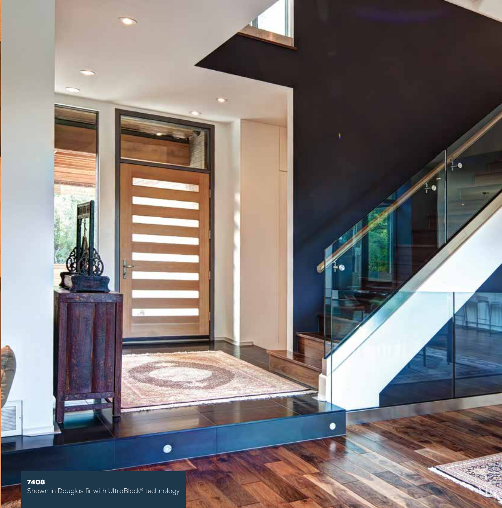
7408 Shown in Douglas fir with UltraBlock® technology