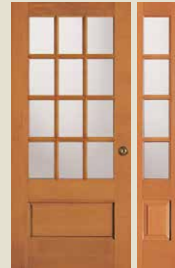
37512 SDL, IG 7512 TDL 7804 TDL / 37804 SDL sidelight