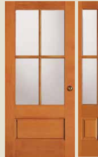
37504 SDL, IG 7504 TDL 37802 SDL, IG / 7802 TDL sidelight