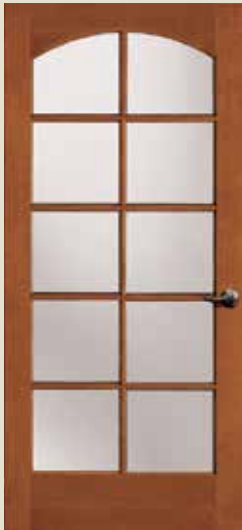
37050 SDL, IG 7050 TDL