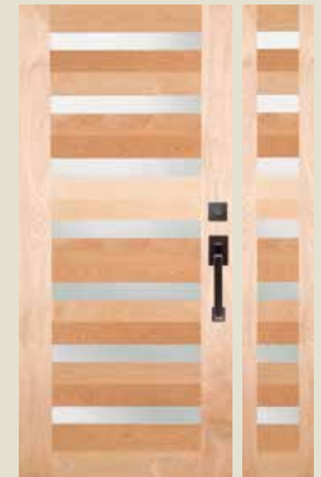
7407 IG Shown in white birch with 7817 sidelight and optional shaker sticking