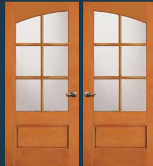
37626 SDL, IG 7626 TDL