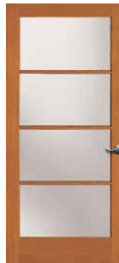
37104 SDL, IG 7104 TDL