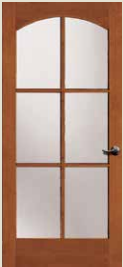
37056 SDL, IG 7056 TDL