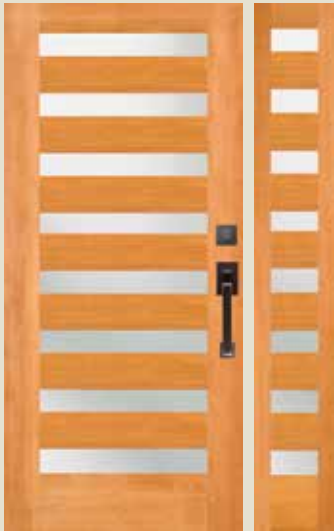
7408 IG with 7818 sidelight and optional shaker sticking