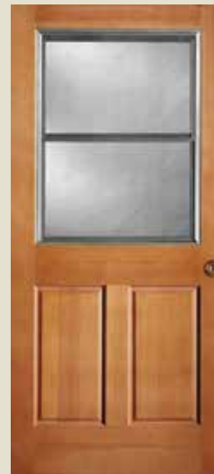
2184 SG Double-hung sash w/ built-in screen