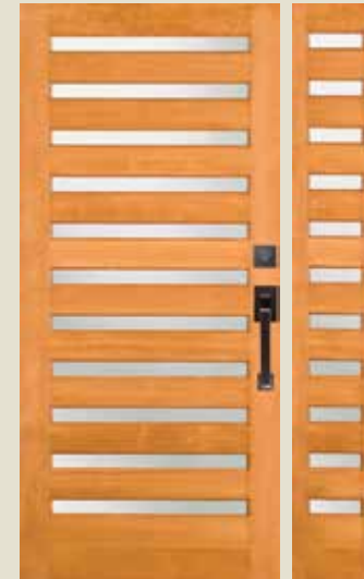
7411 IG with 7811 sidelight