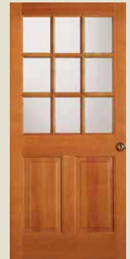
37944 SDL, IG 7944 SDL, IG