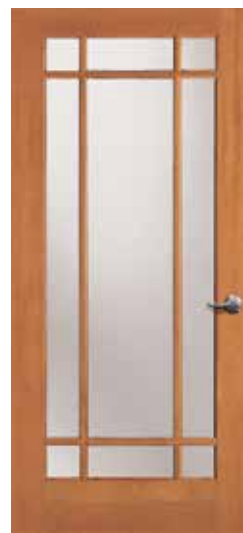
37109 SDL, IG 7109 TDL