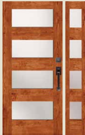
7404 IG Shown in cherry with 7814 sidelight and optional shaker sticking