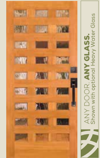
7427 IG with optional heavy water glass. Privacy Rating 4.