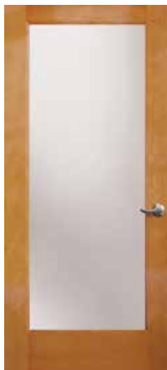
7002 IG Wide layout