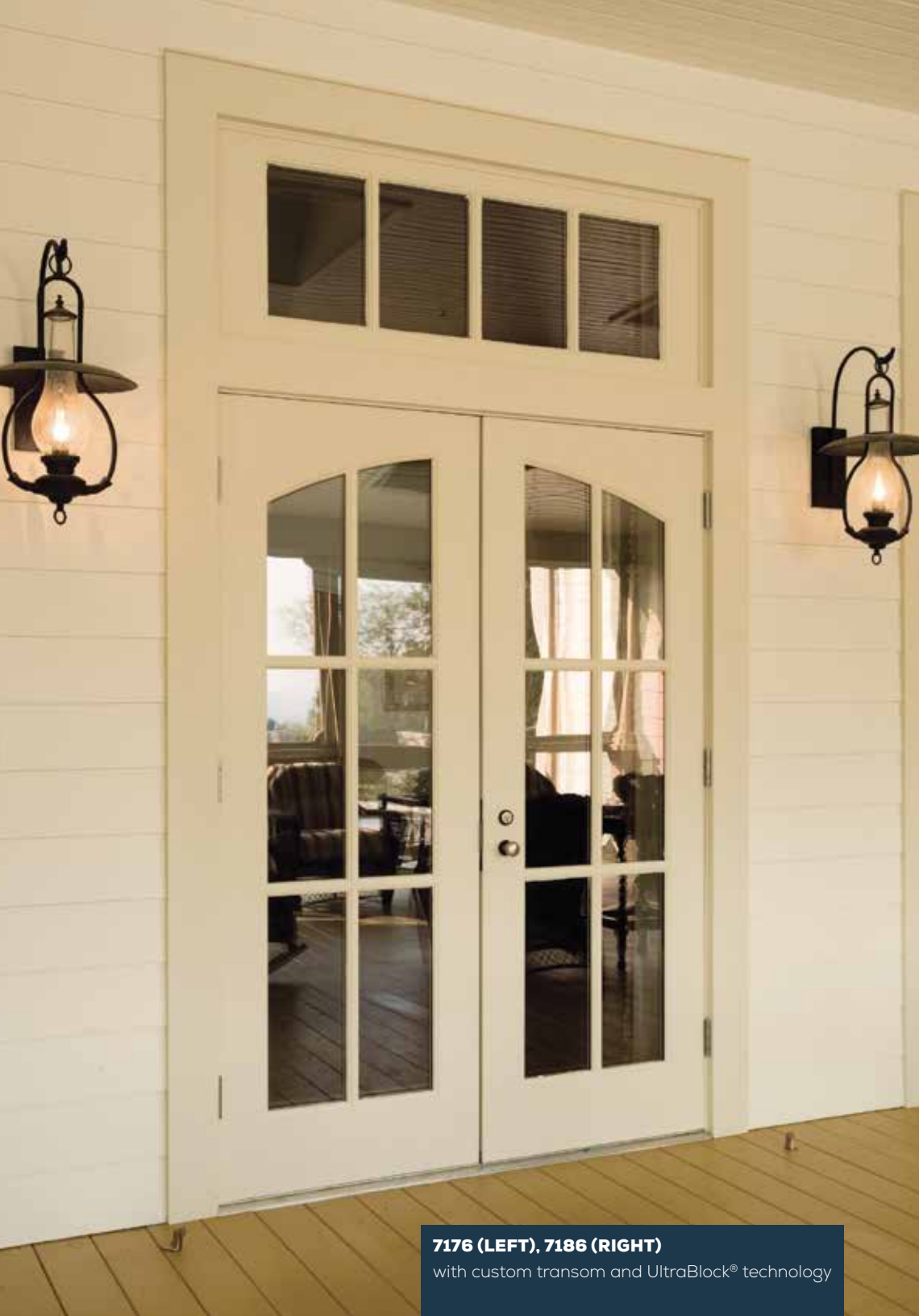
7176 (LEFT), 7186 (RIGHT) with custom transom and UltraBlock® technology