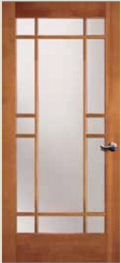
37151 SDL, IG 7151 TDL