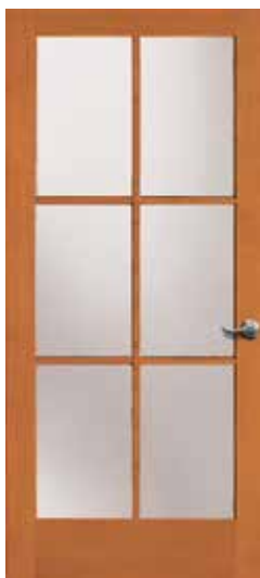
37106 SDL, IG 7106 TDL