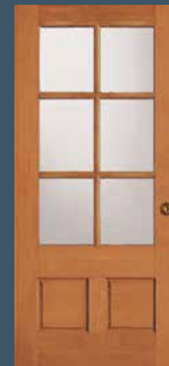
37526 SDL, IG 7526 TDL