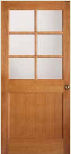
37682 SDL IG 7682 TDL