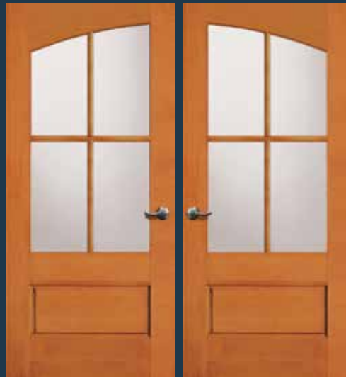
37604 SDL, IG 7604 TDL