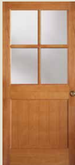
37482 SDL IG 7482 TDL