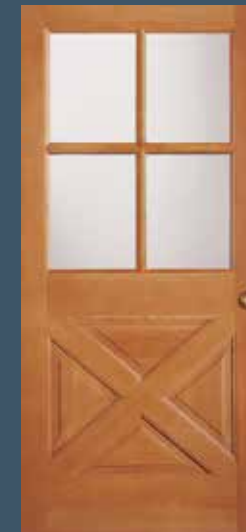
37435 SDL IG 7435 TDL