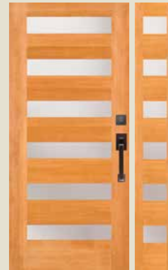
7406 IG with 7816 sidelight and optional shaker sticking