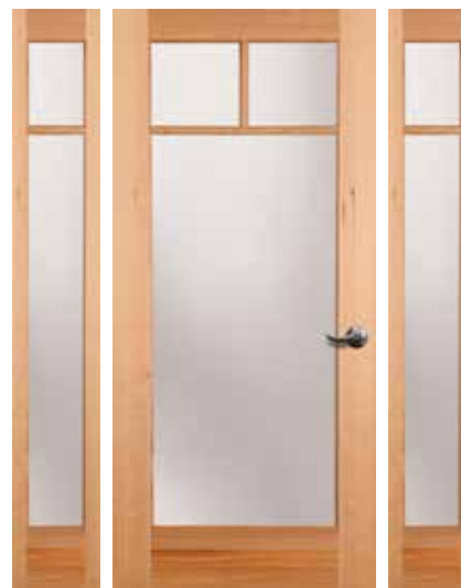
37152 SDL, IG / 7152 TDL Shown in hemlock with 37162 SDL, IG / 7162 TDL sidelights