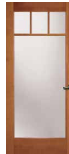
37153 SDL, IG 7153 TDL

DOORS INCLUDE THESE OPTIONS (SEE SIMPSONDOOR.COM/OPTIONS):