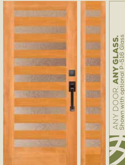
7409 IG with 7819 sidelight and optional shaker sticking and P-516 glass. Privacy Rating 9.