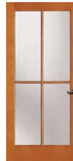
37122 SDL, IG 7122 TDL