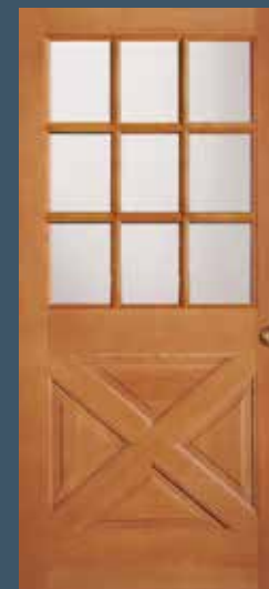
37035 SDL IG 7035 TDL