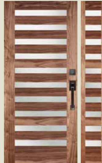
7410 IG Shown in walnut with 7810 sidelight and optional shaker sticking