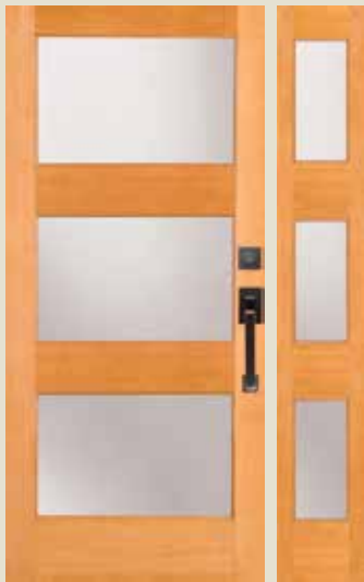
7403 IG with 7813 sidelight