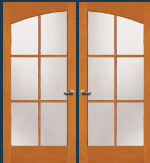
37176 SDL, IG 7176 TDL