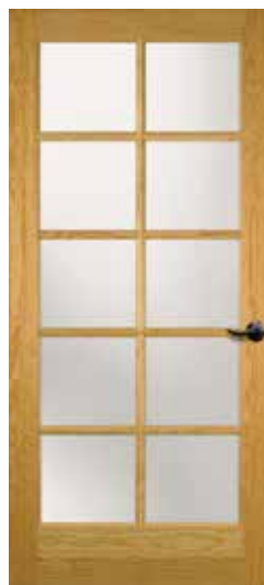
37010 SDL, IG 7010 TDL Shown in ponderosa pine