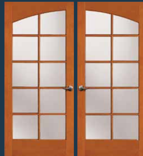
37170 SDL, IG 7170 TDL