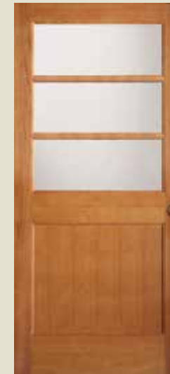
37382 SDL IG 7382 TDL