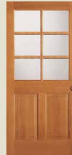
37644 SDL, IG 7644 SDL, IG