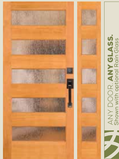
7405 IG with 7815 sidelight and optional rain glass. Privacy Rating 7.