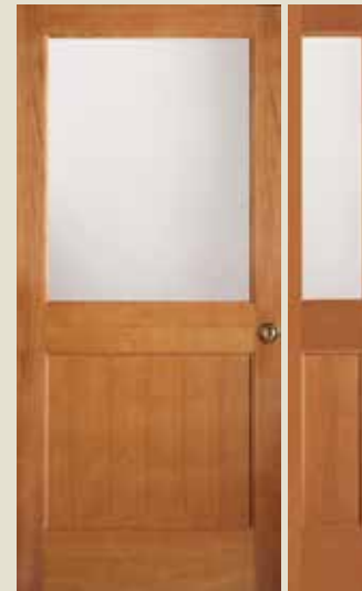
7081 IG 7702 sidelight