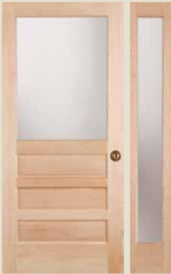
7118 IG Shown in maple with 7701 sidelight