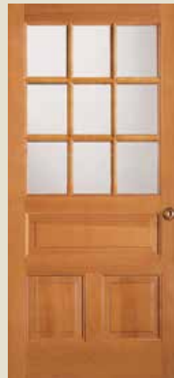
37570 SDL, IG 7570 TDL