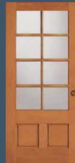
37528 SDL, IG 7528 TDL