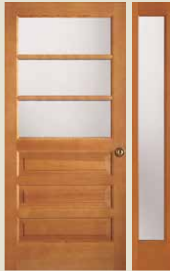
37318 SDL, IG 7318 TDL 7701 sidelight