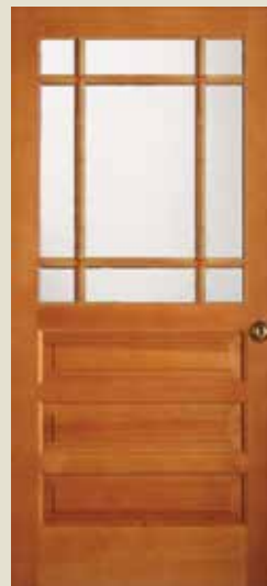
37998 SDL, IG 7998 TDL