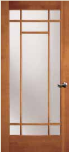
37156 SDL, IG 7156 TDL