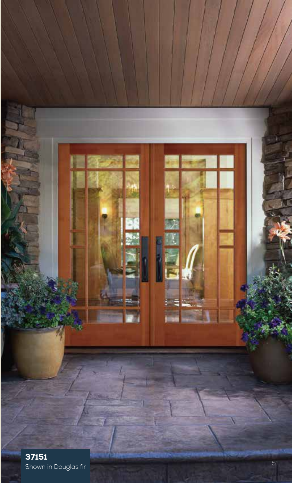
37151 Shown in Douglas fir