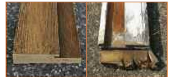
PLASTPRO PF™ FRAME *with HydroShield Technology™

MOISTURE RESISTANT ROT RESISTANT INSECT RESISTANT TWICE THE SCREW HOLDING POWER OF WOOD READY TO PAINT OR STAIN